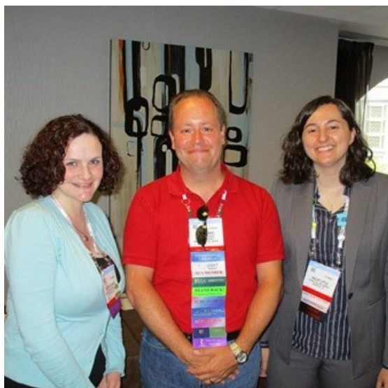
New Beta Phi Mu Initiates, from L to R: