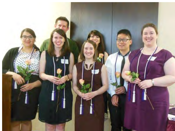
The New Pi Lambda Sigma Members